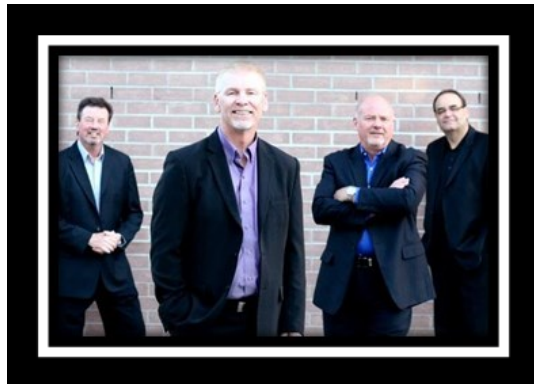
THE MASTERS FOUR

In Concert @ Forest Baptist Church Saturday - May 14th - 7 pm. Free Will Offering