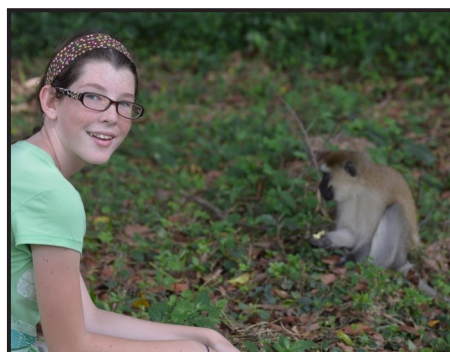
We spent a Saturday morning at the Botanical Gardens in Entebbe. It was a great place to get away from the city to enjoy the quiet and the monkeys.